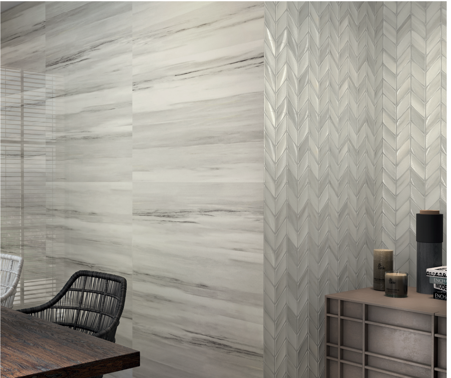
ASH Aden Deco Bright (Decorative wall on the right)