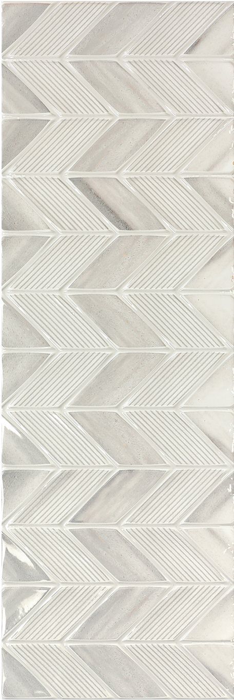
ASH Aden Deco Bright 30 x 90 cm (11.811" x 35.433") DN.RV.ASH.1236.AD.BR

All items shown in this document are part of Olympia's stocking program. For special orders, please contact your Olympia Tile Sales Representative.