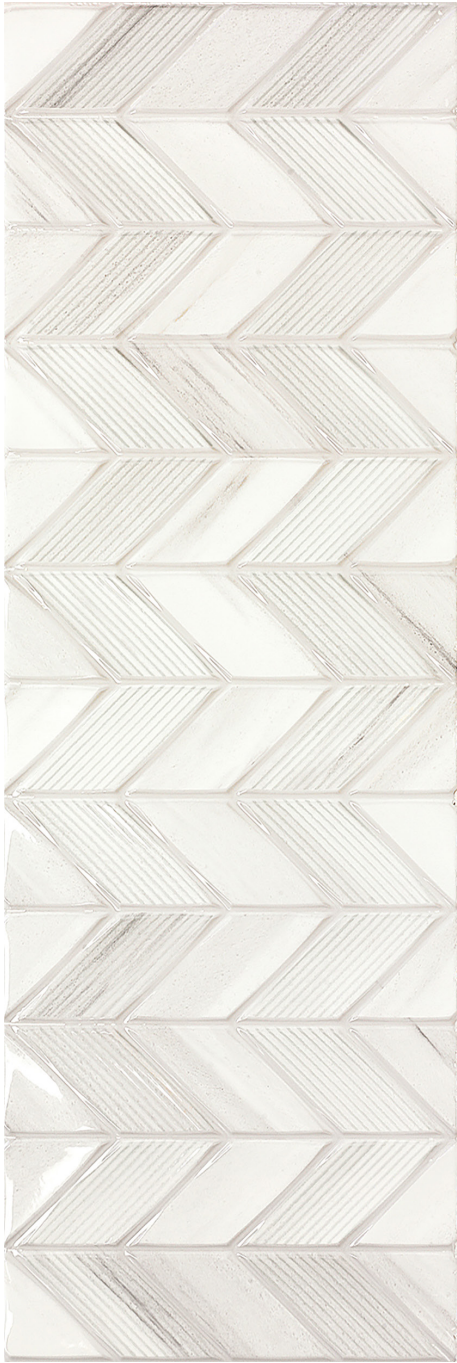
WHITE Aden Deco Bright 30 x 90 cm (11.811" x 35.433") DN.RV.WHT.1236.AD.BR