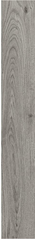
10 x 70 cm (4 x 28) MZ.WE.GRY.0428