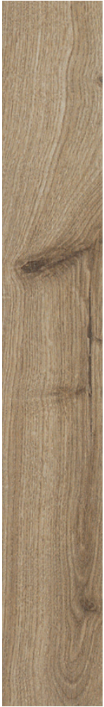
10 x 70 cm (4 x 28) MZ.WE.BGE.0428