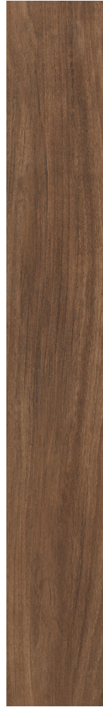
10 x 70 cm (4 x 28) MZ.WE.WAL.0428

All items shown in this document are part of Olympia's stocking program. For special orders, please contact your Olympia Tile Sales Representative.