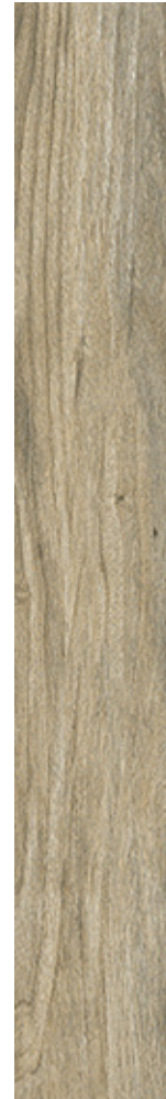
10 x 70 cm (4 x 28) MZ.WE.HNY.0428

All items shown in this document are part of Olympia's stocking program. For special orders, please contact your Olympia Tile Sales Representative.