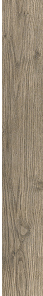
10 x 70 cm (4 x 28) MZ.WE.BWN.0428