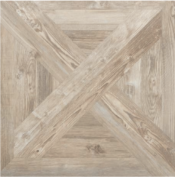
60 x 60 cm (23.63 x 23.63) RF.BT.NAT.2424