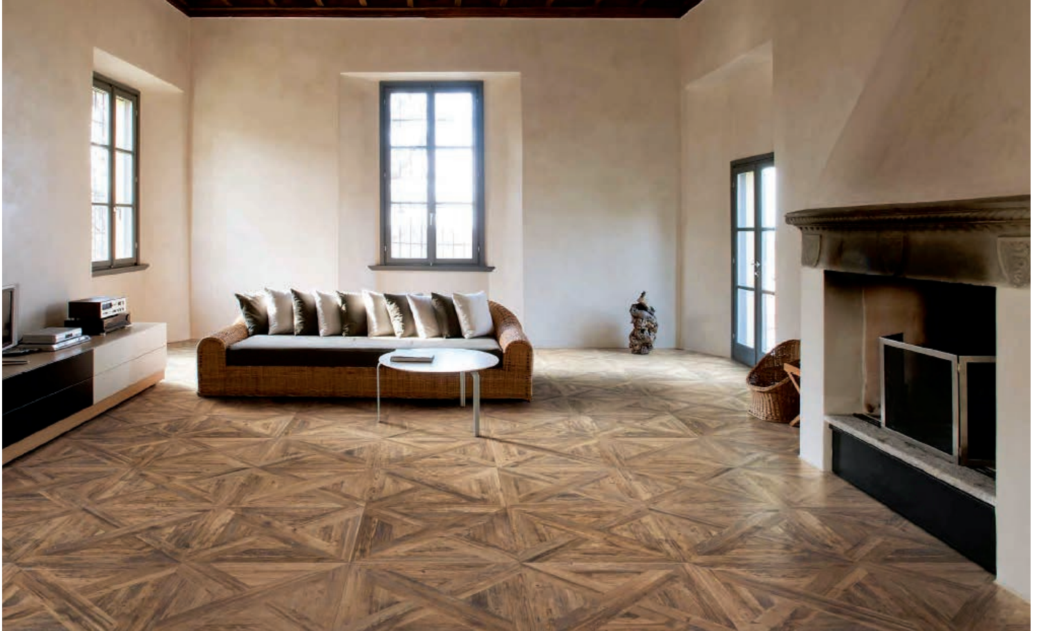
SUN (Dark Beige)