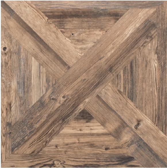
60 x 60 cm (23.63 x 23.63) RF.BT.SUN.2424

All items shown in this document are part of Olympia's stocking program. For special orders, please contact your Olympia Tile Sales Representative.