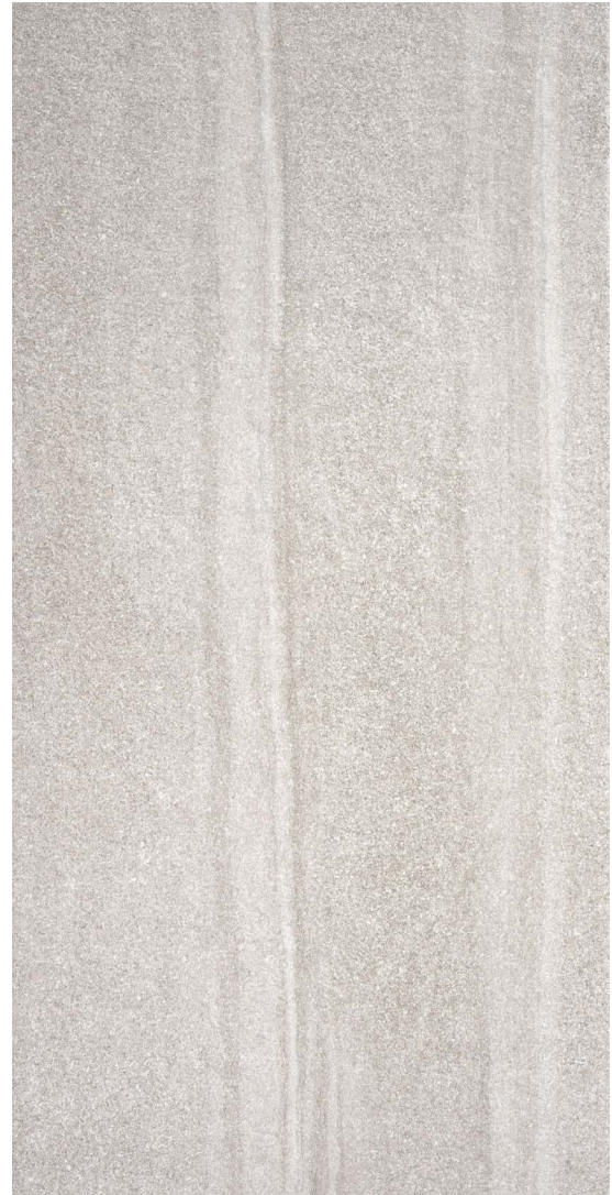
GREY Matte Finish

30 x 60 cm (11.82" x 23.63") UN.BN.BGE.1224.MT