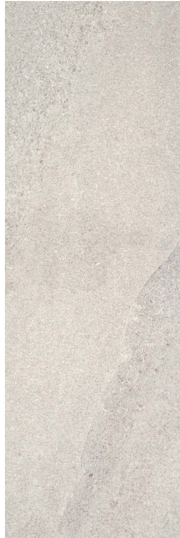
GREY Bright Finish

20 x 60 cm (7.88" x 23.63") UN.BN.BGE.0824.BR