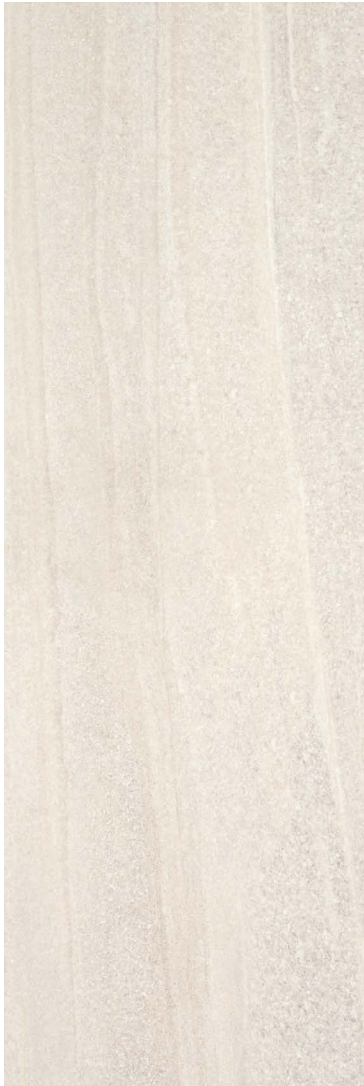
BEIGE Bright Finish

20 x 60 cm (7.88" x 23.63") UN.BN.BGE.0824.BR