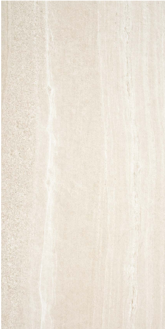
BEIGE Matte Finish

30 x 60 cm (11.82" x 23.63") UN.BN.BGE.1224.MT