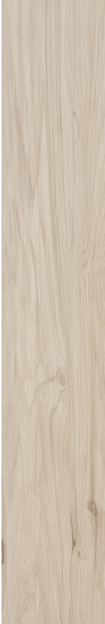
20x120 cm (8x48) KM.KR.APP.0848