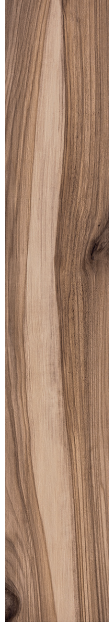
20x120 cm (8x48) KM.KR.NUT.0848

All items shown in this document are part of Olympia's stocking program. For special orders, please contact your Olympia Tile Sales Representative.