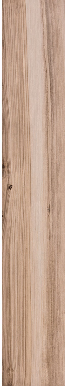
20x120 cm (8x48) KM.KR.APT.0848