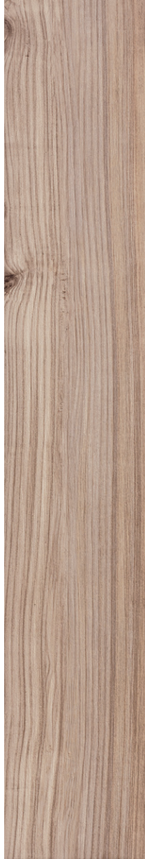
20x120 cm (8x48) KM.KR.PCH.0848