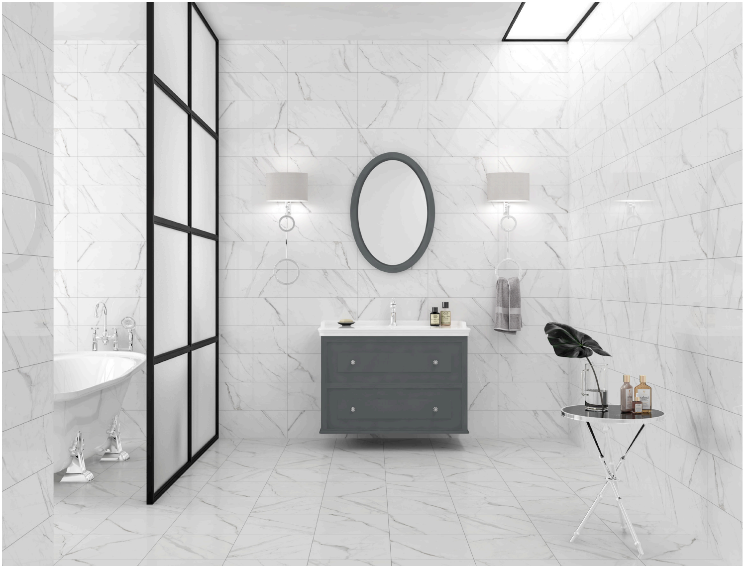
Floor: Glazed Porcelain 13" x 13" White Matte Wall: Glazed Wall 8" x 20" White Glossy