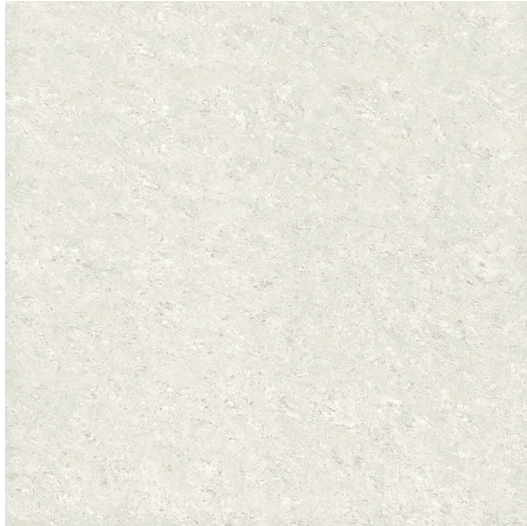
WHITE Polished Finish 60 x 60 cm (23.62" x 23.62") NY.NS.WHT.2424.PL