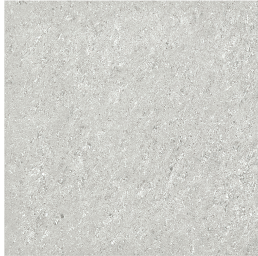
GREY Polished Finish 60 x 60 cm (23.62" x 23.62") NY.NS.GRY.2424.PL