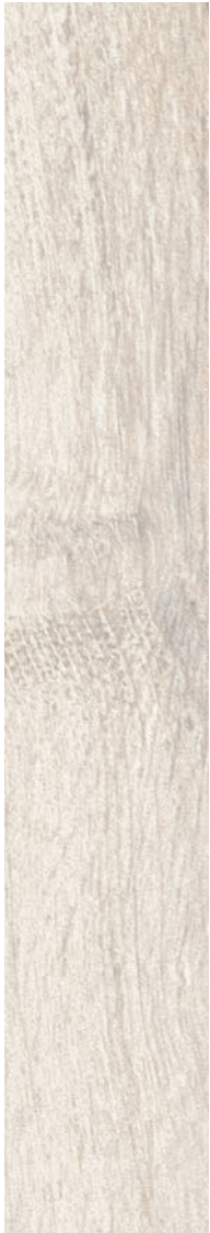
15 x 90 cm (6 x 36) GE.SV.PRL.0636