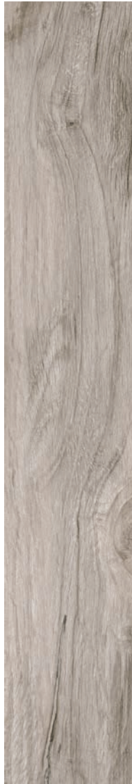
15 x 90 cm (6 x 36) GE.SV.SIL.0636