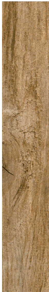
15 x 90 cm (6 x 36) GE.SV.HNY.0636