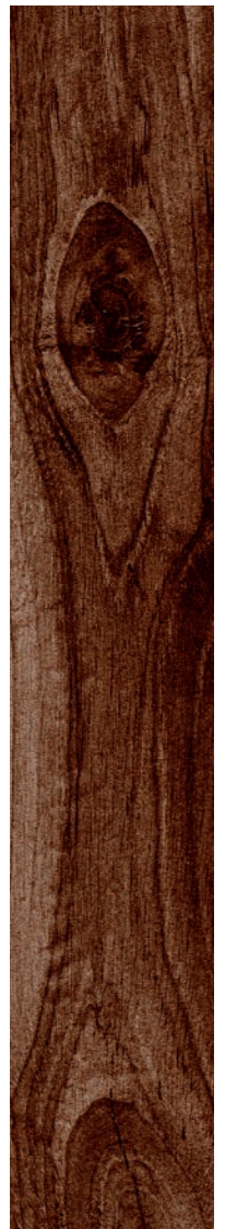
15 x 90 cm (6 x 36) GE.SV.WNN.0636

All items shown in this document are part of Olympia's stocking program. For special orders, please contact your Olympia Tile Sales Representative.