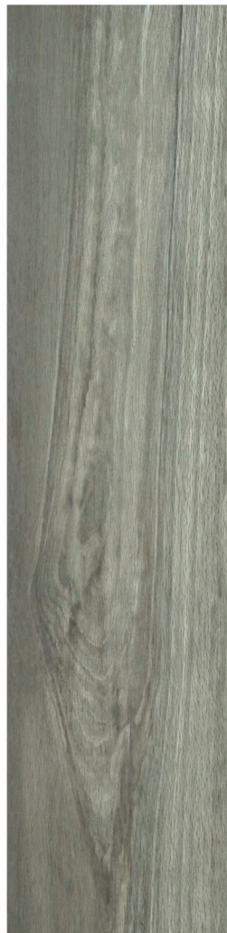
GREY 6" x 24" Code# TR.TM.GRY.0624