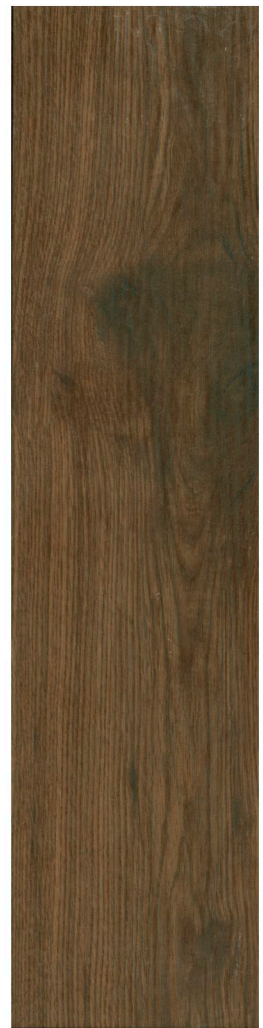
CHESTNUT (Dk. Brown) 6" x 24" Code# TR.TM.CNT.0624