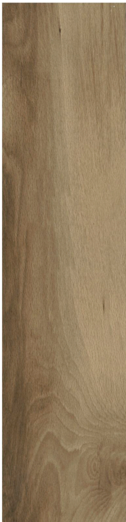
OAK (Beige) 6" x 24" Code# TR.TM.OAK.0624

This is for your handy reference. Colours and styles shown here are meant only to give you a preliminary indication pending the development of sampling, which will be rushed to you as soon as possible.