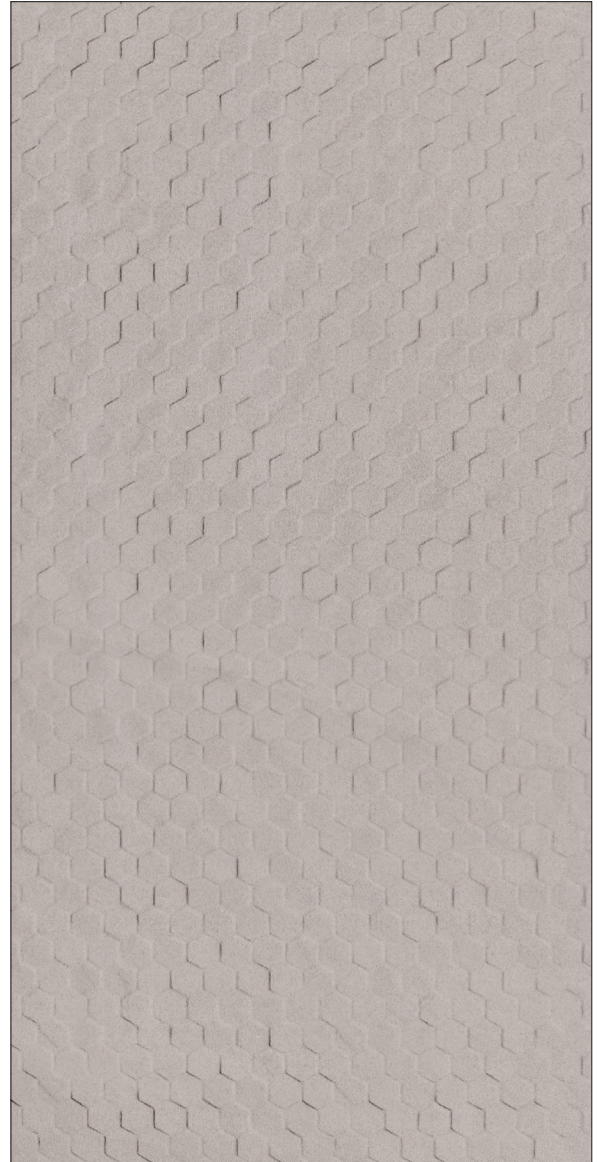
30 x 60 cm (12 x 24) Decor GE.CI.TPE.1224.DEC

All items shown in this document are part of Olympia's stocking program. For special orders, please contact your Olympia Tile Sales Representative.