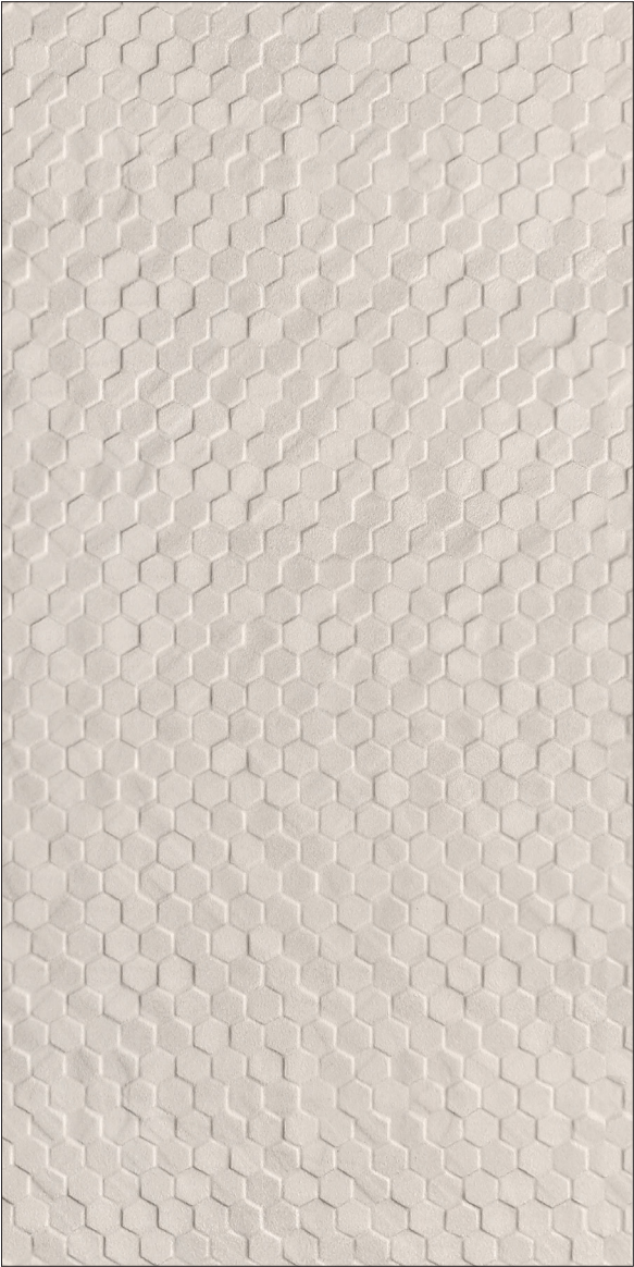
30 x 60 cm (12 x 24) Decor GE.CI.IVO.1224.DEC

All items shown in this document are part of Olympia's stocking program. For special orders, please contact your Olympia Tile Sales Representative.