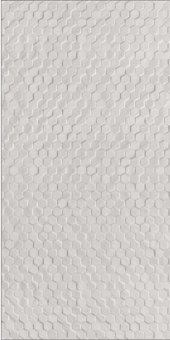
30 x 60 cm (12 x 24) Decor GE.CI.GRY.1224.DEC