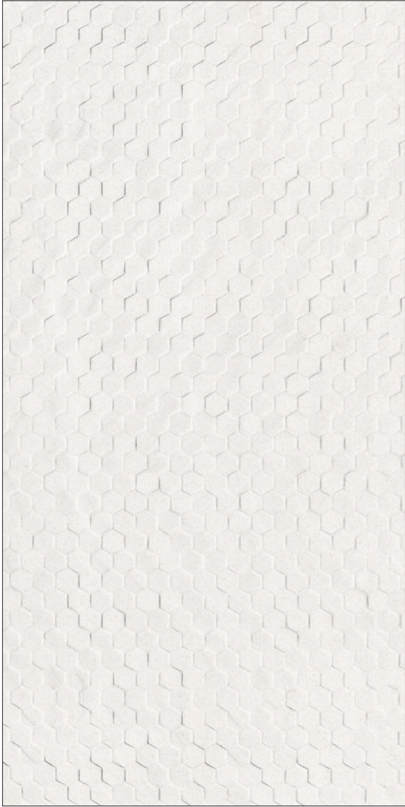
30 x 60 cm (12 x 24) Decor GE.CI.WHT.1224.DEC