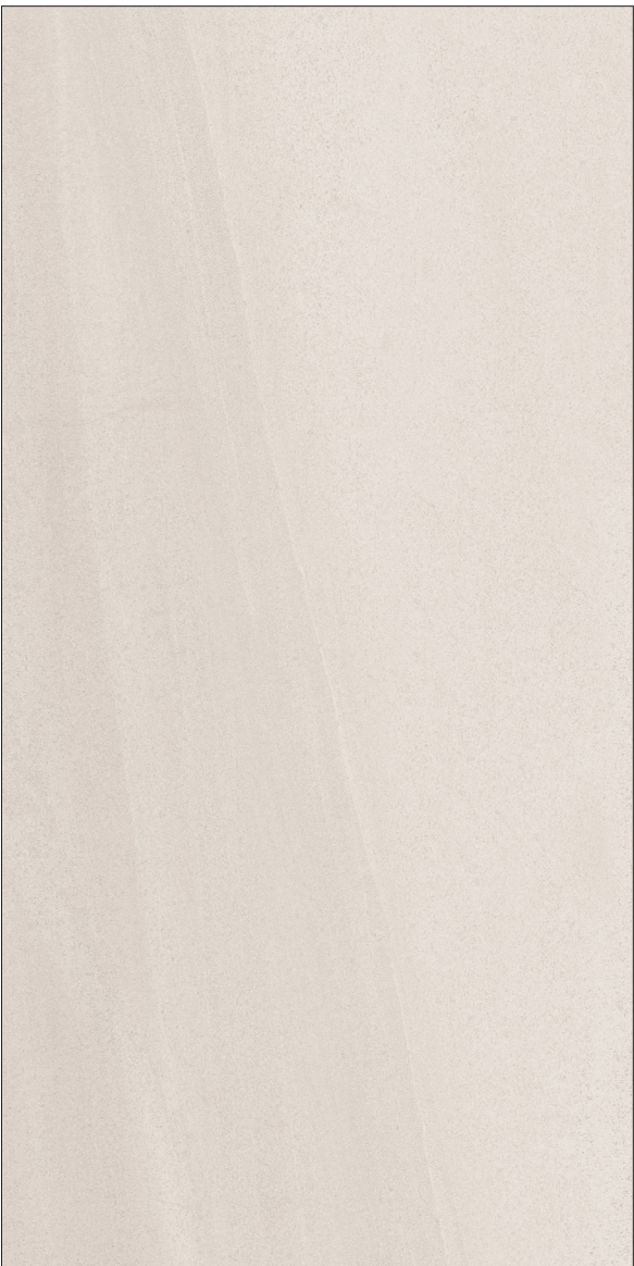
30 x 60 cm (12 x 24) GE.CI.IVO.1224

All items shown in this document are part of Olympia's stocking program. For special orders, please contact your Olympia Tile Sales Representative.