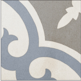
20 x 20 cm (8 x 8) OE.CM.RT2.0808