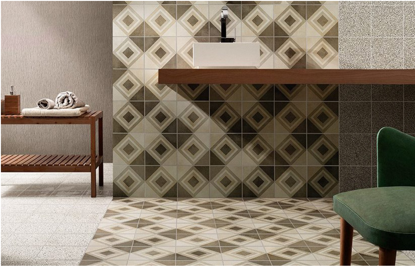
RETRO 4 ( Bone, Grey, Taupe)