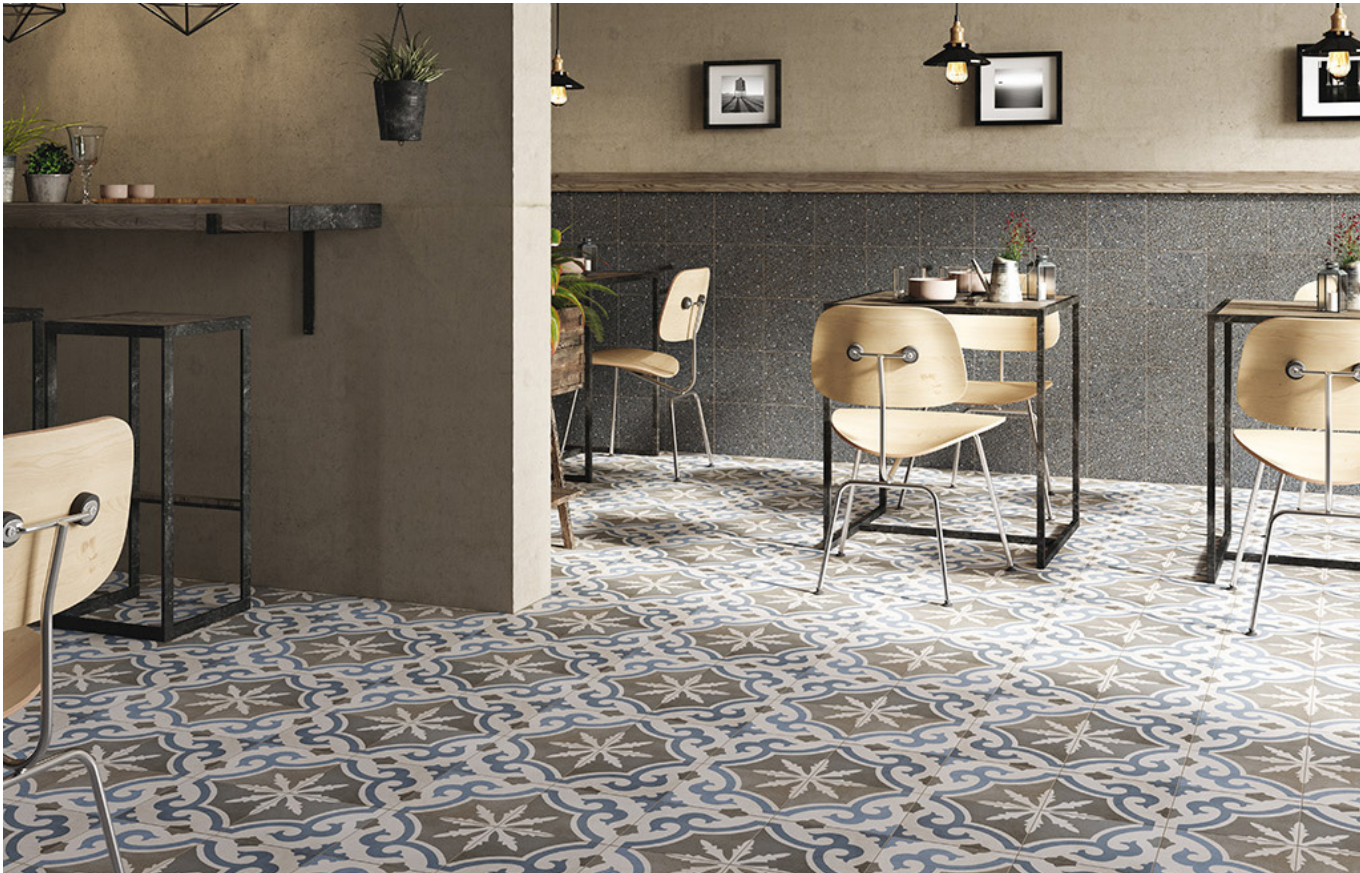
RETRO 2 ( Blue, Grey)