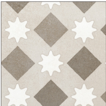
20 x 20 cm (8 x 8) OE.CM.RT5.0808

All items shown in this document are part of Olympia's stocking program. For special orders, please contact your Olympia Tile Sales Representative.