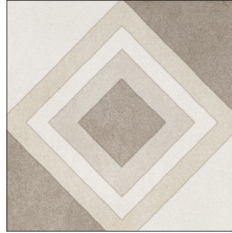
20 x 20 cm (8 x 8) OE.CM.RT4.0808