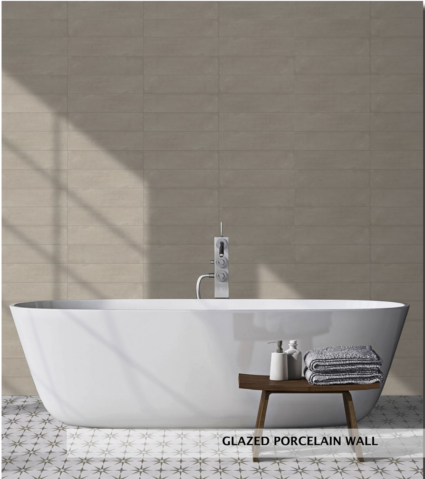
GLAZED PORCELAIN WALL

A beautiful collection of wall tiles in 5 contemporary colors. The slightly undulated finish surrounded by a thin border gives this tile a unique 3D effect.