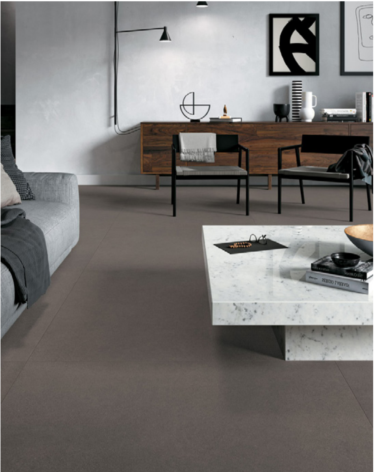
CLASS (Dark Taupe)