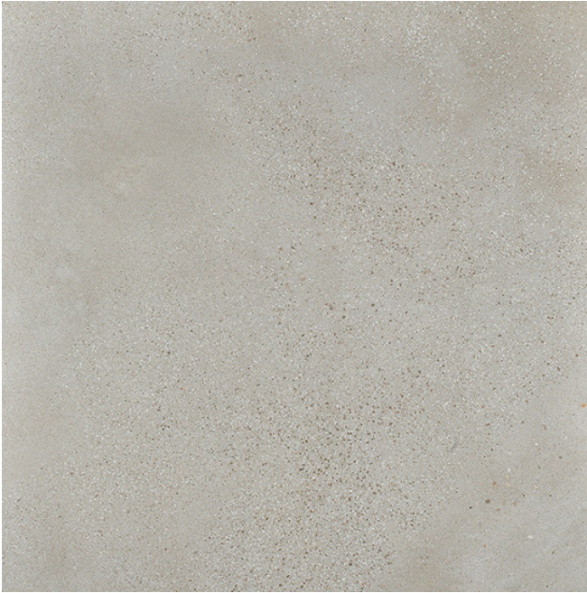
90 x 90 cm (36 x 36) OE.IC.CNR.3636.MT