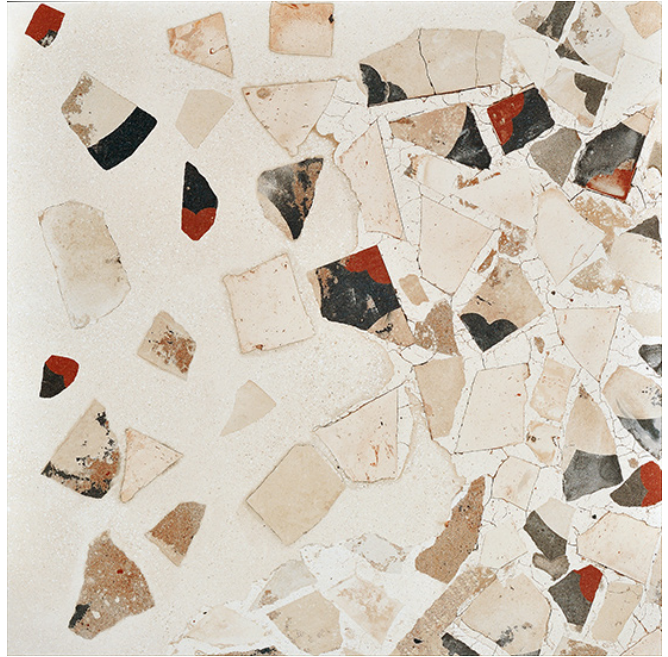
90 x 90 cm (36 x 36) OE.IC.CLE.3636.MT.DC

All items shown in this document are part of Olympia's stocking program. For special orders, please contact your Olympia Tile Sales Representative.