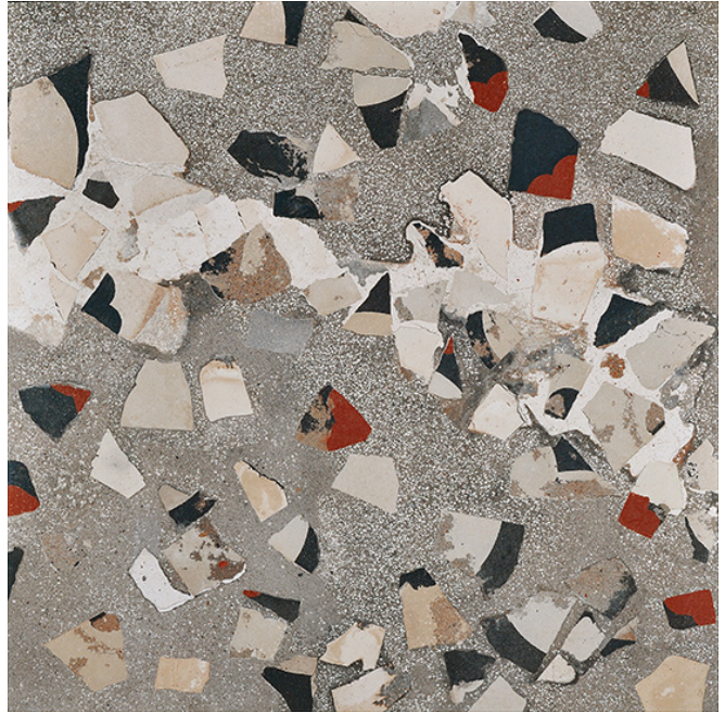
CEMENTO (Dark Grey) DECOR

90 x 90 cm (36 x 36) OE.IC.CMT.3636.MT.DC