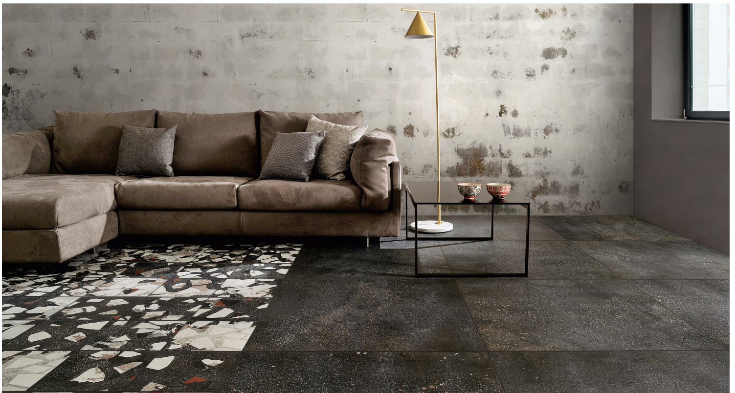
GRAFITE (Black) & GRAFITE (Black) Decor