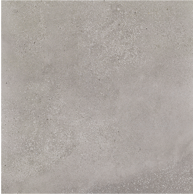
CEMENTO (Dark Grey)