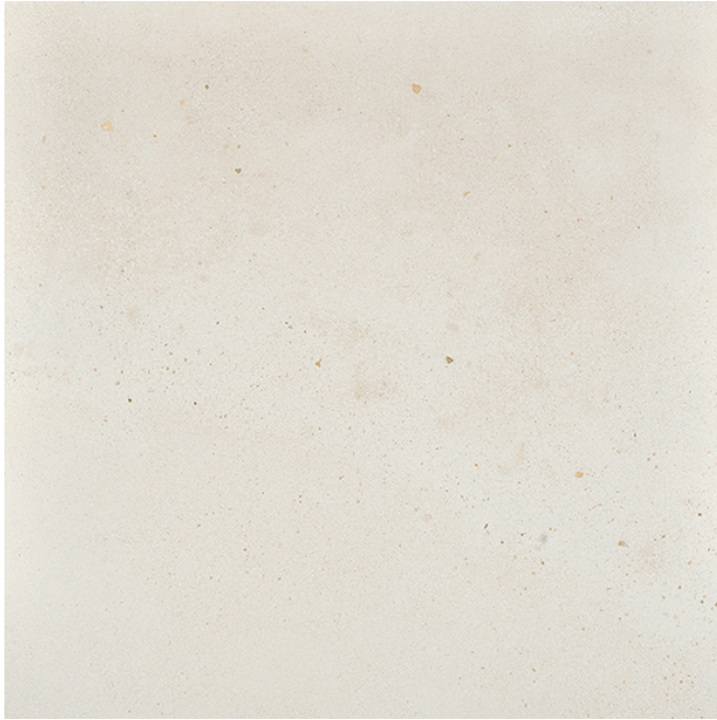
90 x 90 cm (36 x 36) OE.IC.CLE.3636.MT