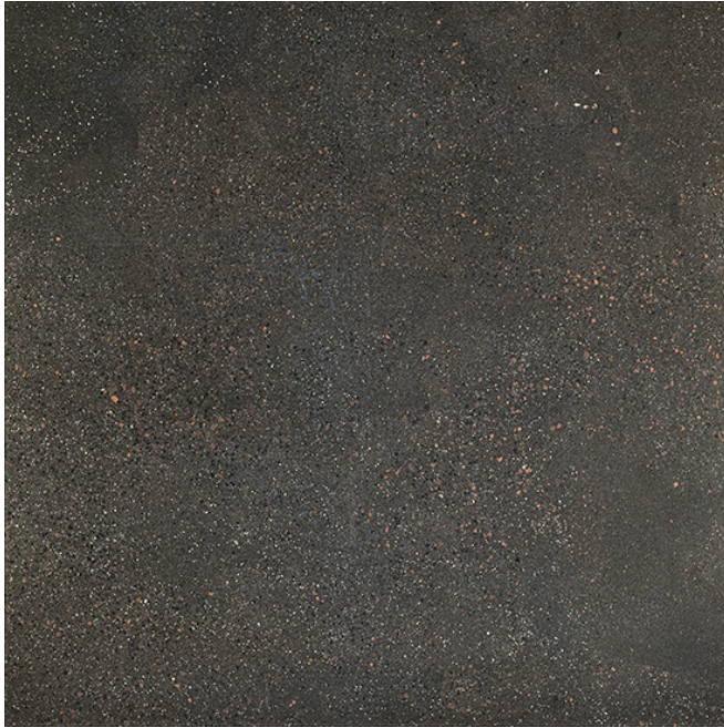
90 x 90 cm (36 x 36) OE.IC.GFT.3636.MT