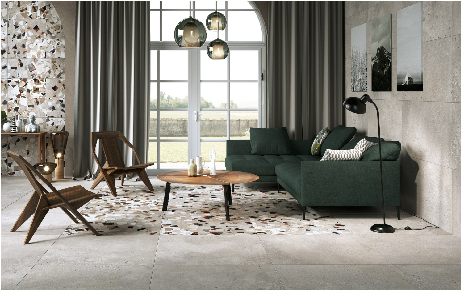
CENERE (Grey) & CENERE (Grey) Decor