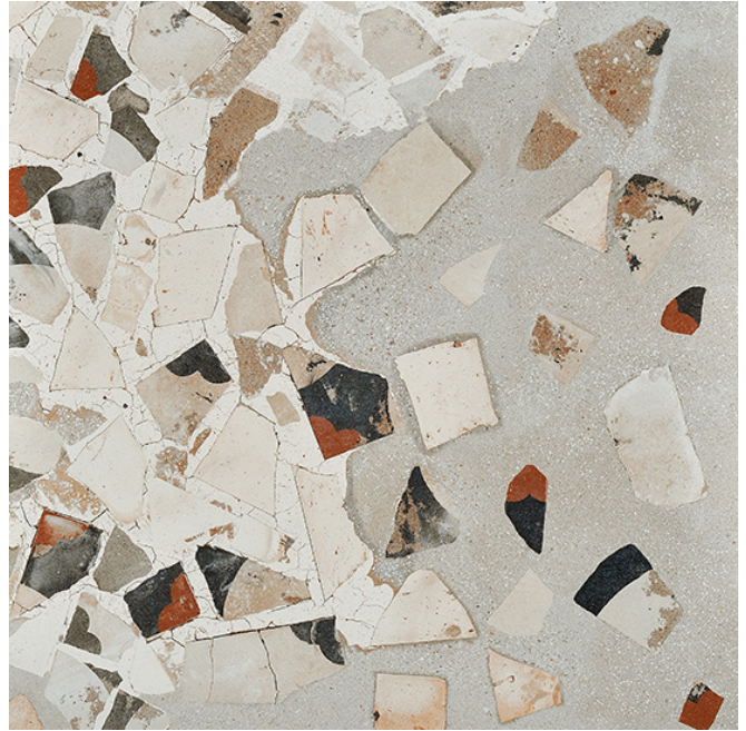
90 x 90 cm (36 x 36) OE.IC.CNR.3636.MT.DC

All items shown in this document are part of Olympia's stocking program. For special orders, please contact your Olympia Tile Sales Representative.