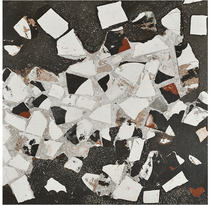
90 x 90 cm (36 x 36) OE.IC.GFT.3636.MT.DC

All items shown in this document are part of Olympia's stocking program. For special orders, please contact your Olympia Tile Sales Representative.