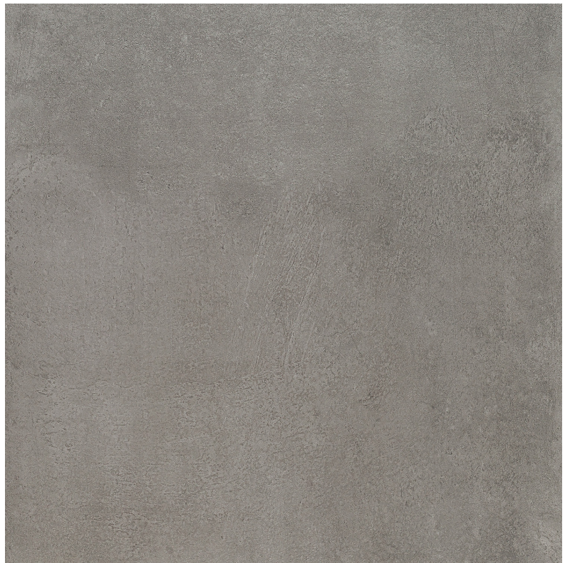
75 x 75 cm (30 x 30) MZ.MM.MER.3030

All items shown in this document are part of Olympia's stocking program. For special orders, please contact your Olympia Tile Sales Representative.