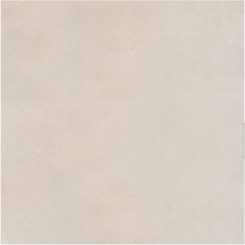
75 x 75 cm (30 x 30) MZ.MM.OLW.3030

All items shown in this document are part of Olympia's stocking program. For special orders, please contact your Olympia Tile Sales Representative.