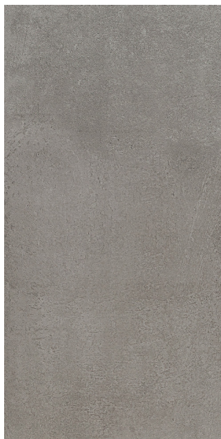
30 x 60 cm (12 x 24) MZ.MM.MER.1224