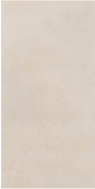
30 x 60 cm (12 x 24) MZ.MM.OLW.1224