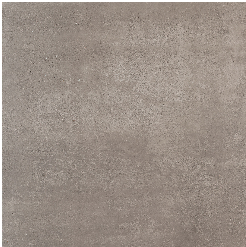
75 x 75 cm (30 x 30) MZ.MM.TPE.3030

All items shown in this document are part of Olympia's stocking program. For special orders, please contact your Olympia Tile Sales Representative.