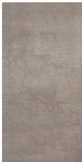
30 x 60 cm (12 x 24) MZ.MM.TPE.1224