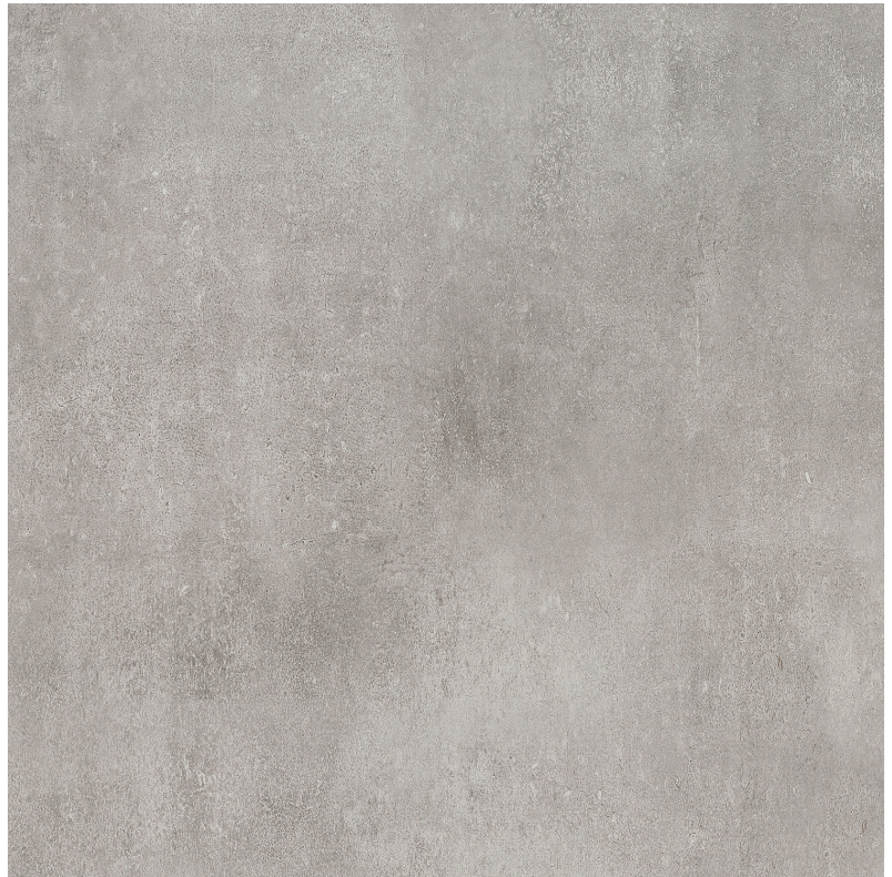
75 x 75 cm (30 x 30) MZ.MM.SIL.3030

All items shown in this document are part of Olympia's stocking program. For special orders, please contact your Olympia Tile Sales Representative.