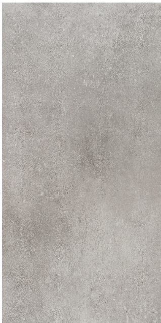
30 x 60 cm (12 x 24) MZ.MM.SIL.1224