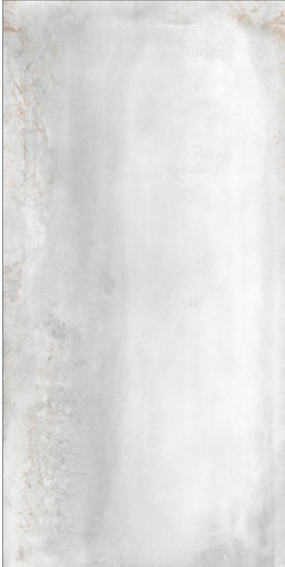
30.8 x 61.5 cm (12" x 24") Matte EX.OX.LHM.1224.MT