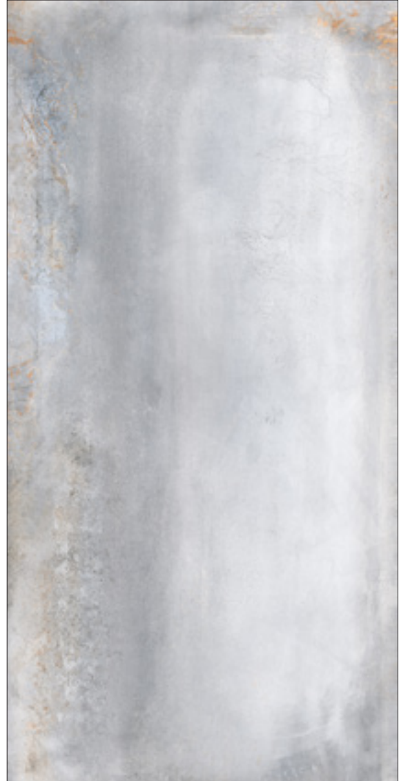
30.8 x 61.5 cm (12" x 24") Matte EX.OX.TTN.1224.MT