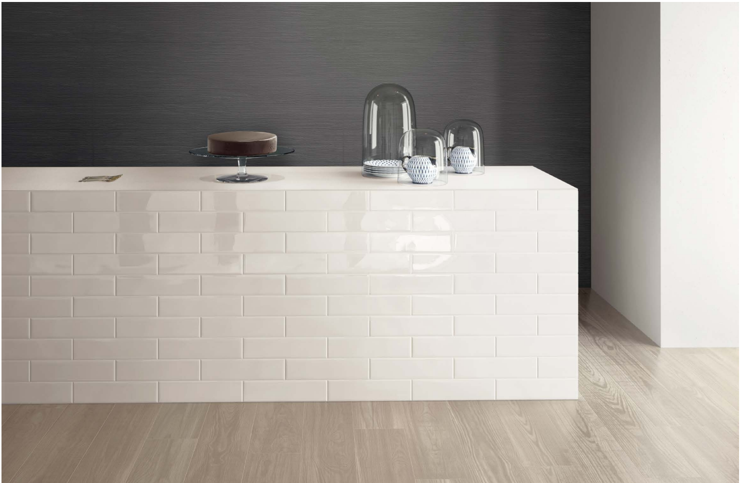
LIGHT (Off White)