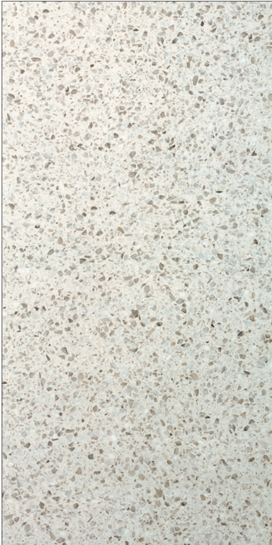
60 x 120 cm (24" x 48") Matte CX.VZ.BIA.2448.MT