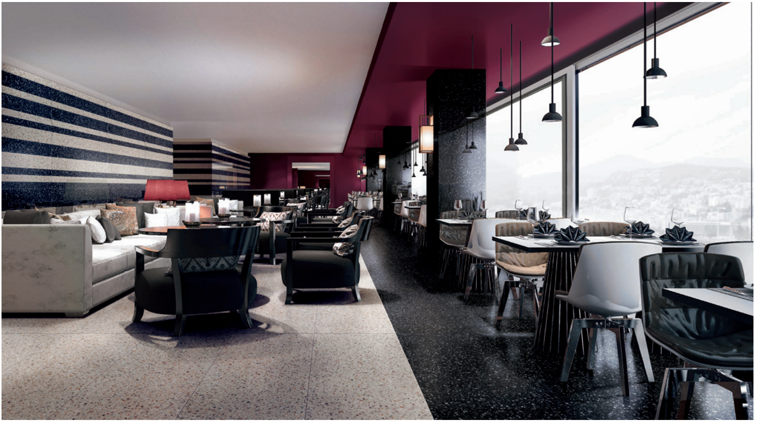
BIANCO & NERO