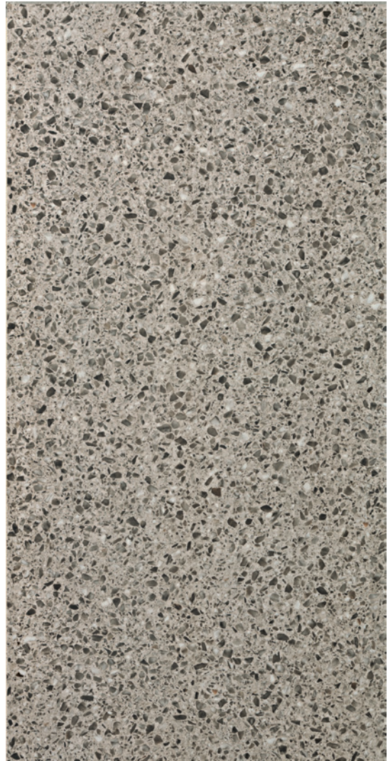
60 x 120 cm (24" x 48") Matte CX.VZ.TTA.2448.MT

All items shown in this document are part of Olympia's stocking program. For special orders, please contact your Olympia Tile Sales Representative.