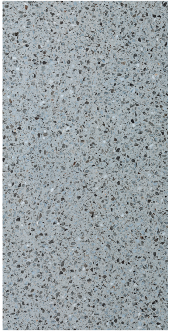
60 x 120 cm (24" x 48") Matte CX.VZ.BLU.2448.MT

All items shown in this document are part of Olympia's stocking program. For special orders, please contact your Olympia Tile Sales Representative.