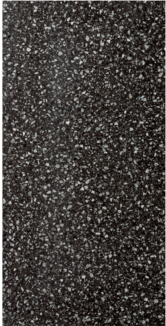
60 x 120 cm (24" x 48") Matte CX.VZ.NRO.2448.MT

All items shown in this document are part of Olympia's stocking program. For special orders, please contact your Olympia Tile Sales Representative.