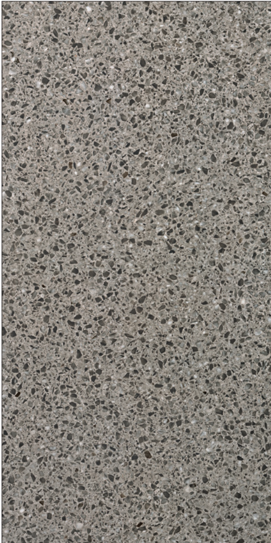
60 x 120 cm (24" x 48") Matte CX.VZ.GRG.2448.MT