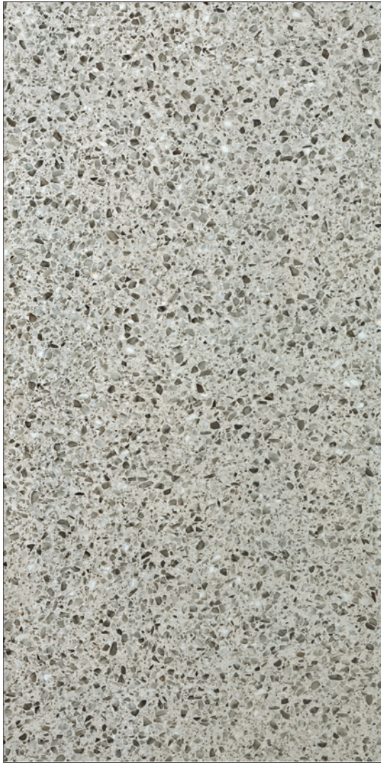
60 x 120 cm (24" x 48") Matte CX.VZ.GSO.2448.MT