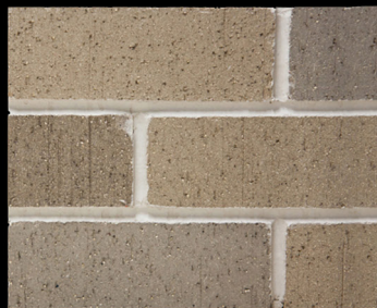
Grouted with grout bag

Following tile set methods, install using thinset over a suitable substrate. Use a grout bag and jointer tool or float for walls. Float grout into the joints for floors. Grout joints are 3/8" thick.