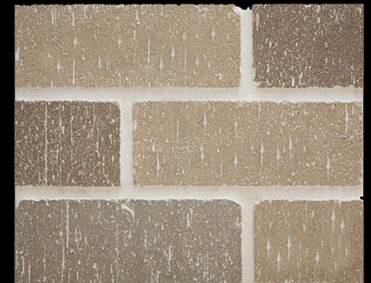
Grout floated into joints