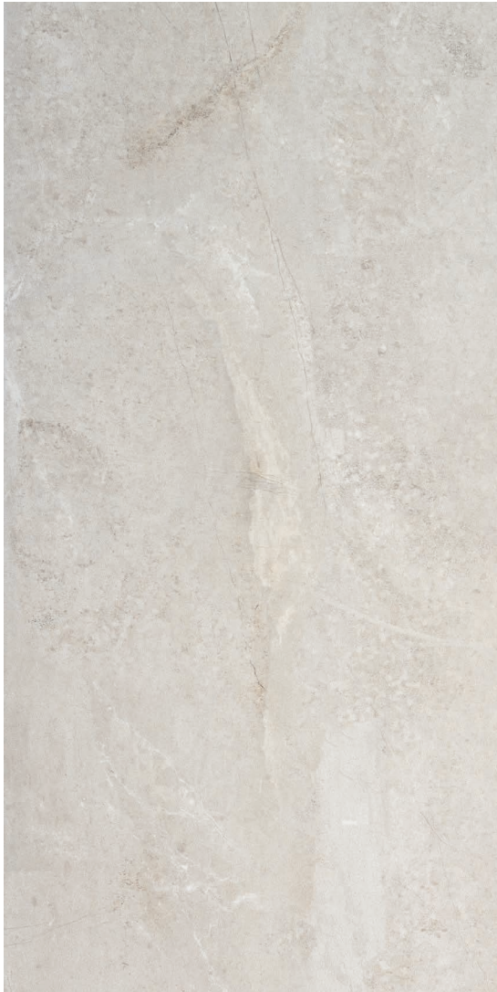
PEARL Matte Finish

30 x 60 cm (11.82" x 23.63") UN.ER.PRL.1224.MT