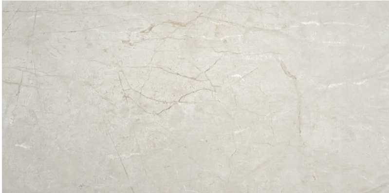
PEARL Matte Finish

25 x 50 cm cm (9.85" x 19.69") UN.ER.PRL.1020.MT