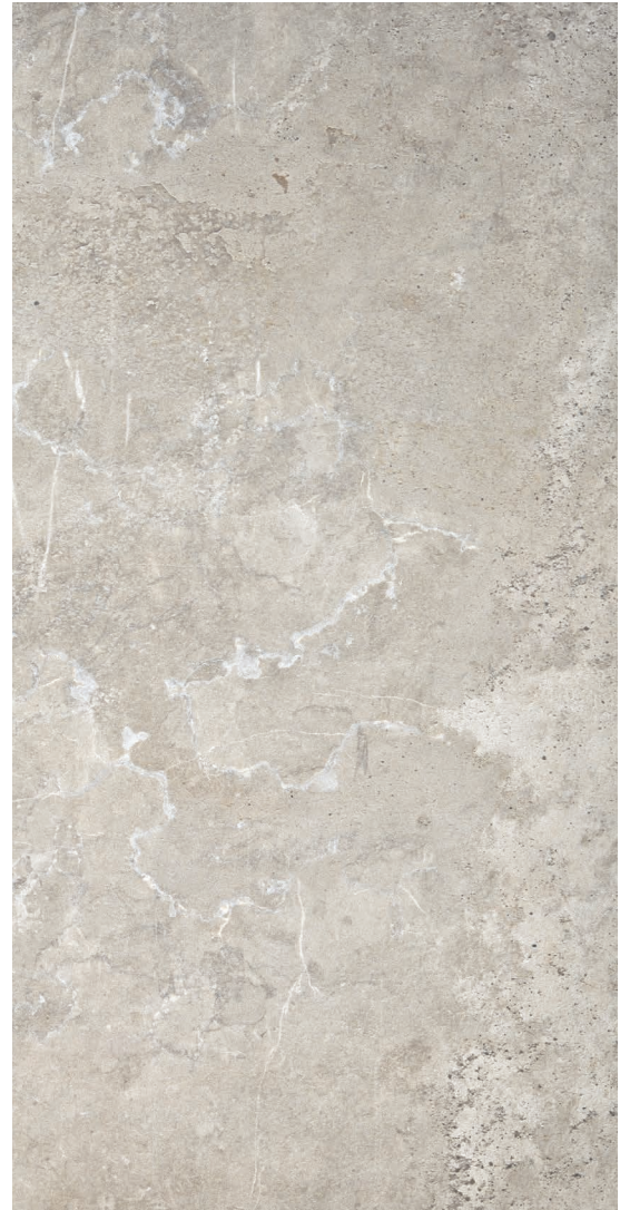
GREY Matte Finish

30 x 60 cm (11.82" x 23.63") UN.ER.PRL.1224.MT