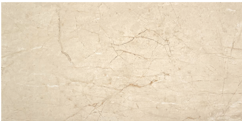
BEIGE Matte Finish

25 x 50 cm cm (9.85" x 19.69") UN.ER.GRY.1020.MT