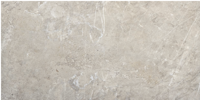
GREY Matte Finish

25 x 50 cm cm (9.85" x 19.69") UN.ER.PRL.1020.MT