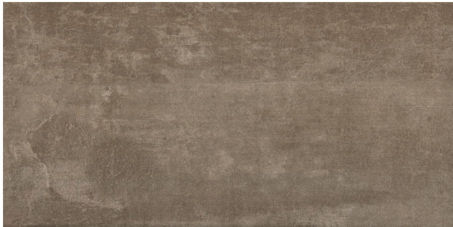
TAUPE (Matte) 25 x 50 cm (9.85" x 19.69") UN.ST.TPE.1020.MT