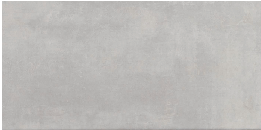
GRIS (Matte) 25 x 50 cm (9.85" x 19.69") UN.ST.GRI.1020.MT