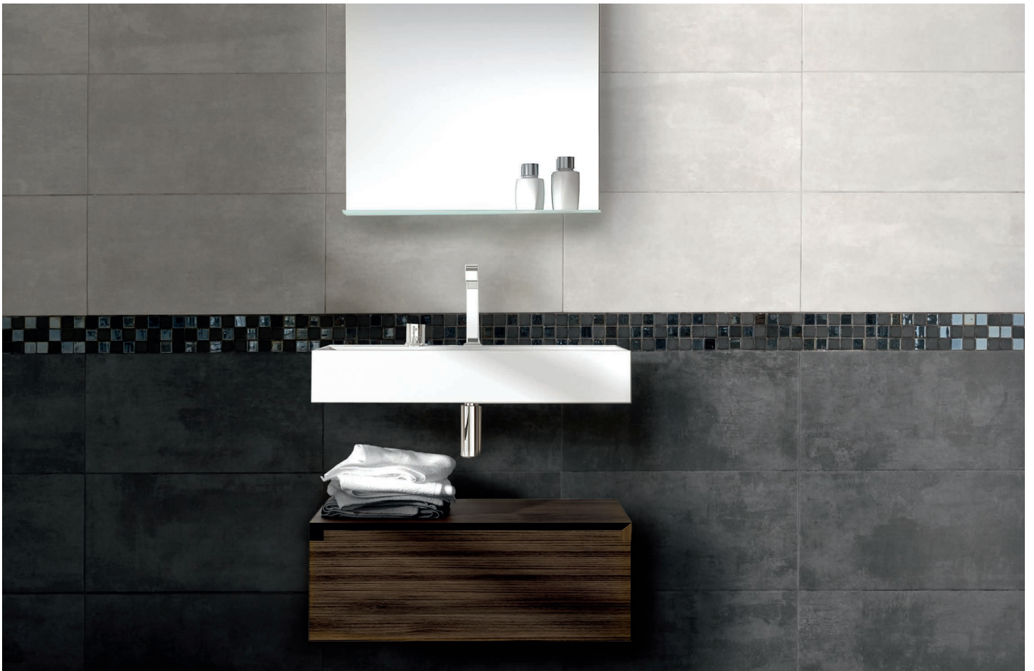
GRIS & GRAFITO