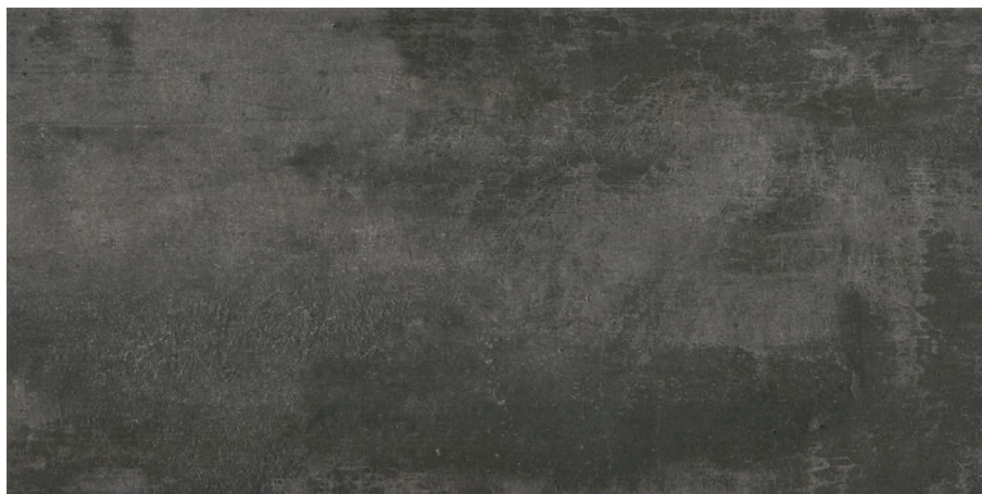
GRAFITO (Matte) 25 x 50 cm (9.85" x 19.69") UN.ST.GFT.1020.MT

All items shown in this document are part of Olympia's stocking program. For special orders, please contact your Olympia Tile Sales Representative.