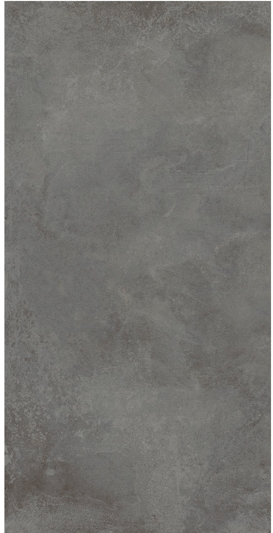
MASTER Matte Finish