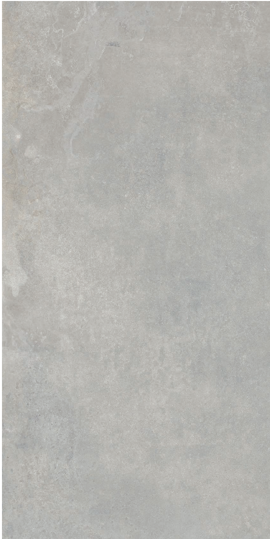
URBAN Matte Finish