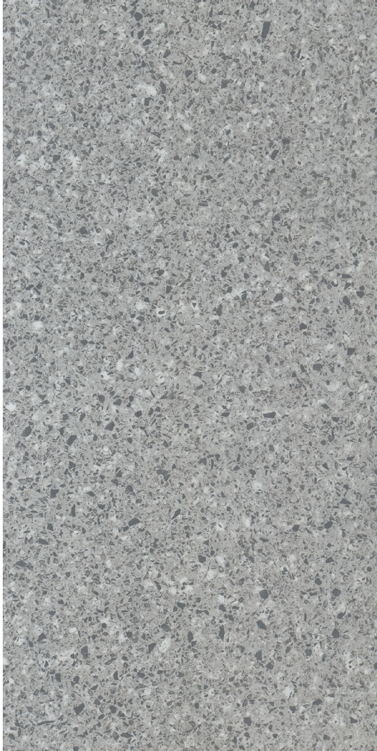
GREY Matte Finish

30 x 60 cm (12" x 24") YU.OS.GRY.1224.MT