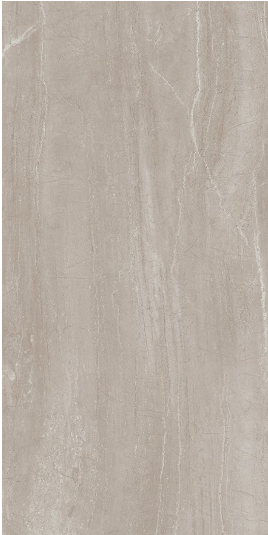
MOKA Matte Finish

30 x 60 cm (12" x 24") DC.NE.MOK.1224.MT