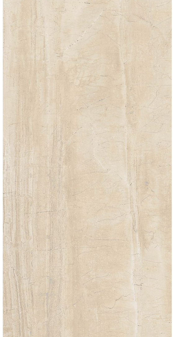
BEIGE Matte Finish

30 x 60 cm (12" x 24") DC.NE.BIA.1224.MT