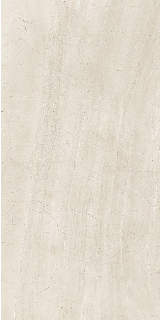
BIANCO Matte Finish

30 x 60 cm (12" x 24") DC.NE.BIA.1224.MT