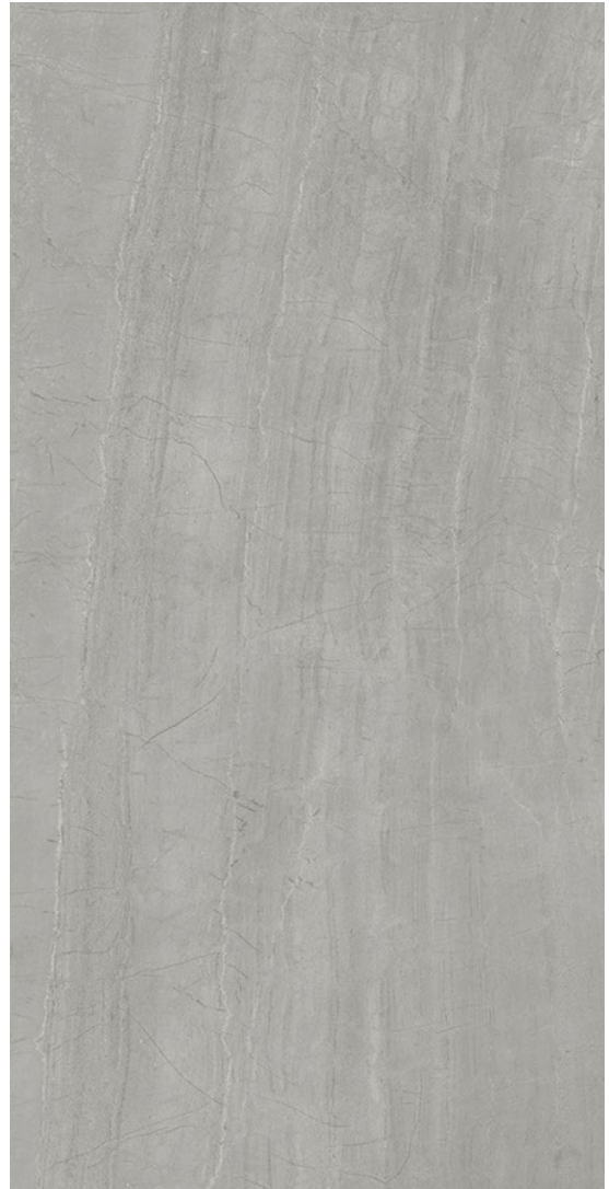
GRIGIO Matte Finish

30 x 60 cm (12" x 24") DC.NE.MOK.1224.MT