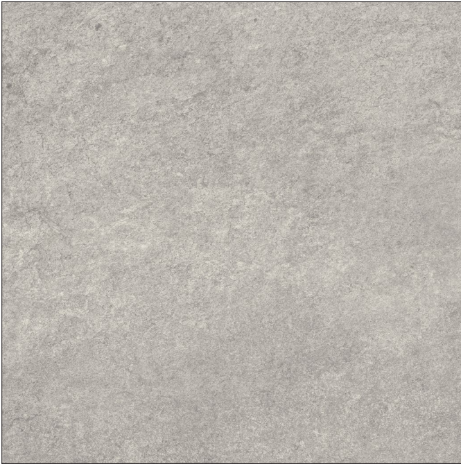
GREY Matte Finish 60 x 60 cm (24" x 24") DE.LD.GRY.2424