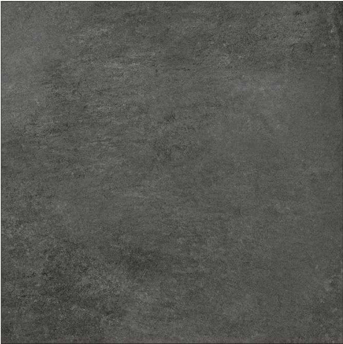
BLACK Matte Finish 60 x 60 cm (24" x 24") DE.LD.BLK.2424

All items shown in this document are part of Olympia's stocking program. For special orders, please contact your Olympia Tile Sales Representative.