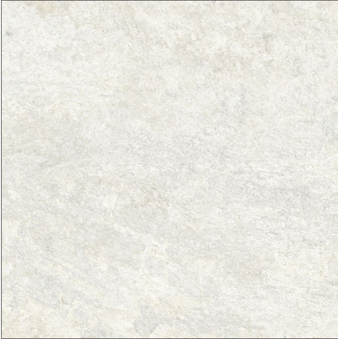
WHITE Matte Finish 60 x 60 cm (24" x 24") DE.LD.WHT.2424