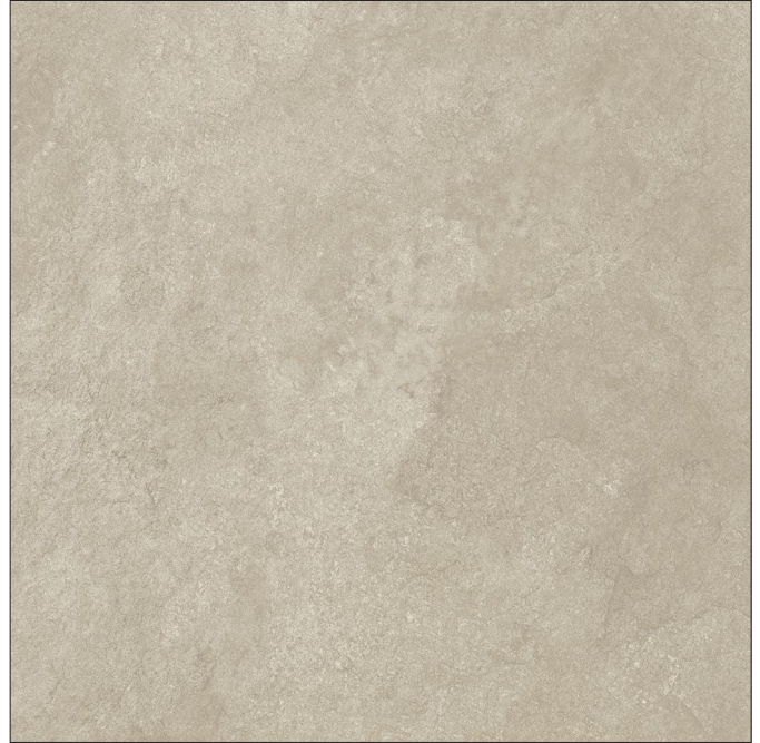
BEIGE Matte Finish 60 x 60 cm (24" x 24") DE.LD.BGE.2424

All items shown in this document are part of Olympia's stocking program. For special orders, please contact your Olympia Tile Sales Representative.