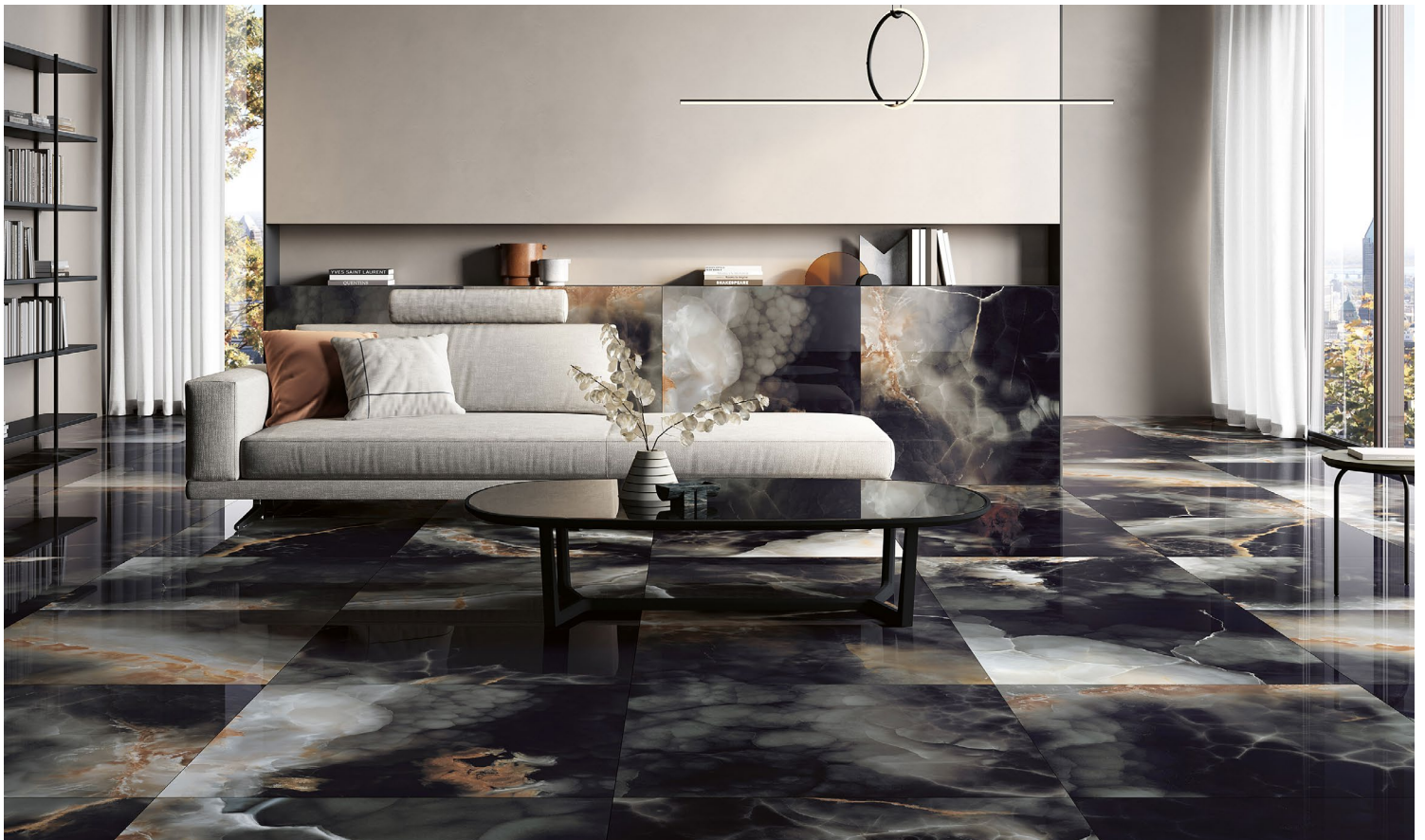
DEEP DARK (Black)