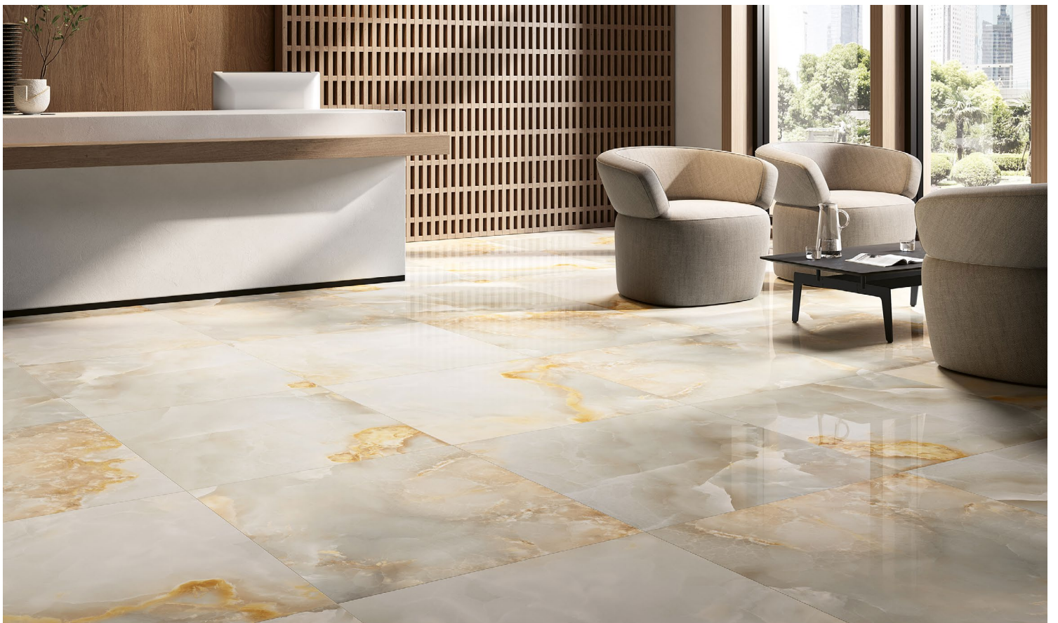
CLOUD GREY (White/Grey)