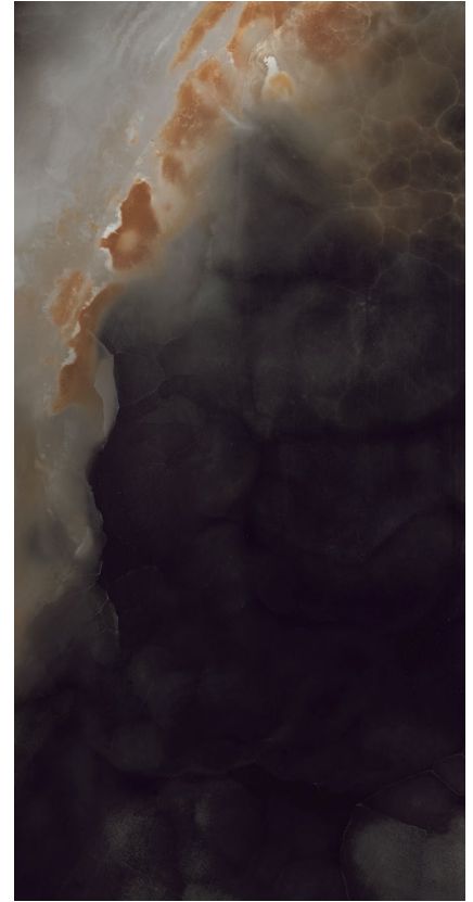
DEEP DARK (Black) 74 x 148 cm (29" x 58") Polished Finish OE.UC.DEP.3060.PL

89 x 89 cm (35" x 35") Polished Finish OE.UC.GRN.3535.PL