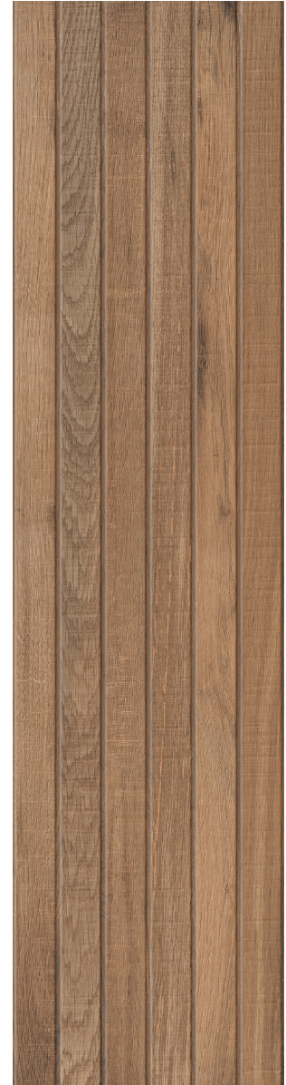
BRUNO (Brown) 30 x 120 cm (12 x 48) Matte Finish Nominal Thickness 9.8 mm LG.WW.BRN.1248.MT

All items shown in this document are part of Olympia's stocking program. For special orders, please contact your Olympia Tile Sales Representative.