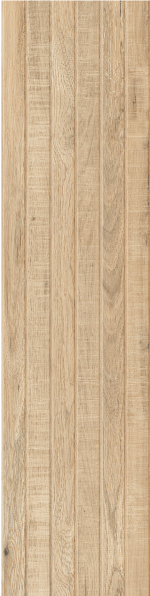
MIELE (Honey) 30 x 120 cm (12 x 48) Matte Finish Nominal Thickness 9.8 mm LG.WW.MLE.1248.MT