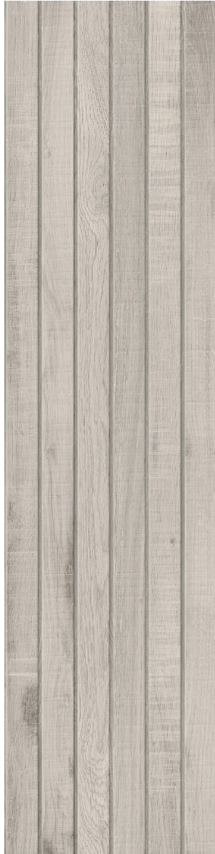
GRIS 30 x 120 cm (12 x 48) Matte Finish Nominal Thickness 9.8 mm LG.WW.GRI.1248.MT