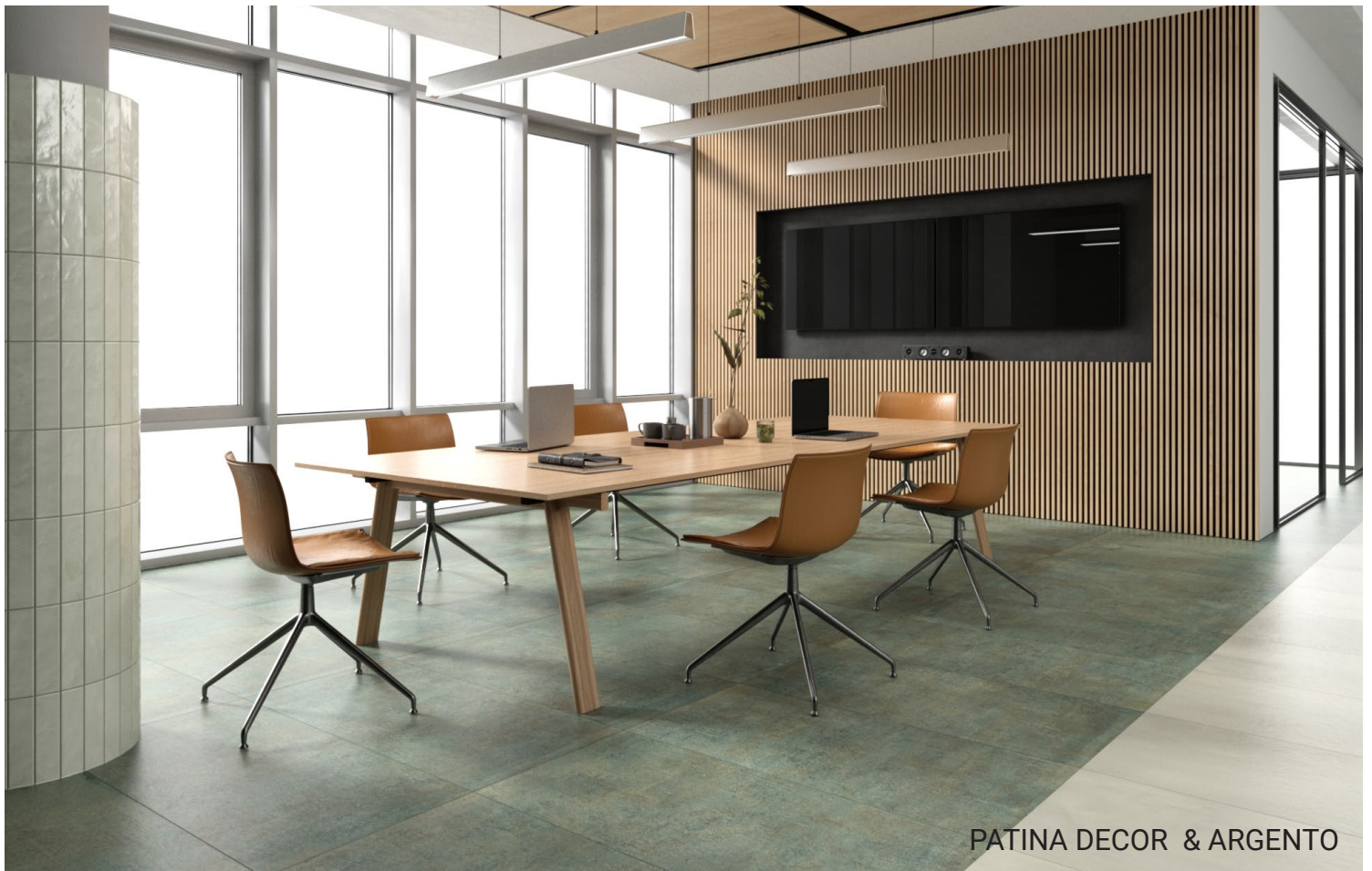
PATINA DECOR & ARGENTO