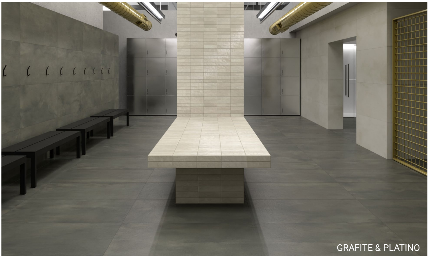
GRAFITE & PLATINO