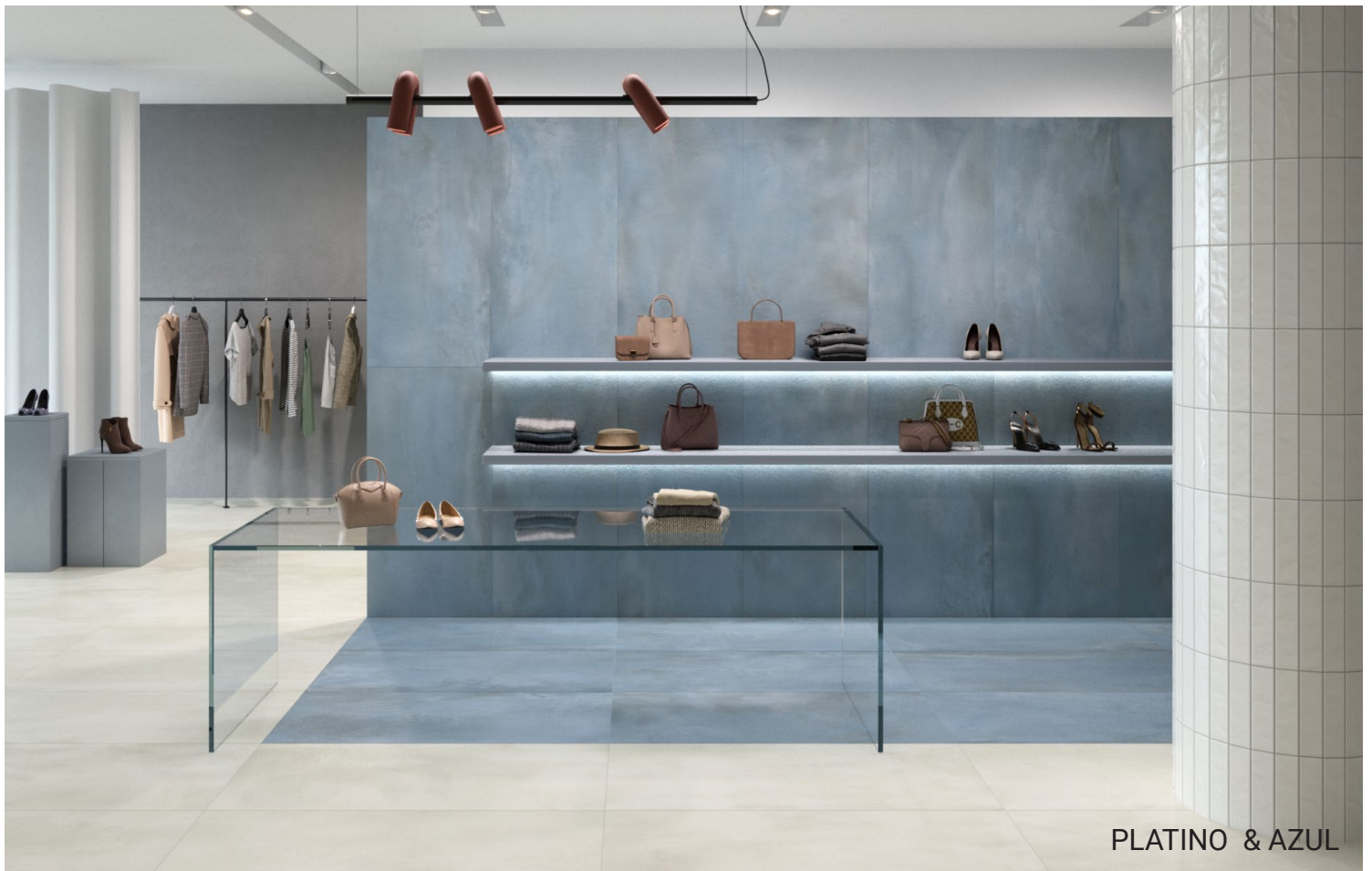
PLATINO & AZUL