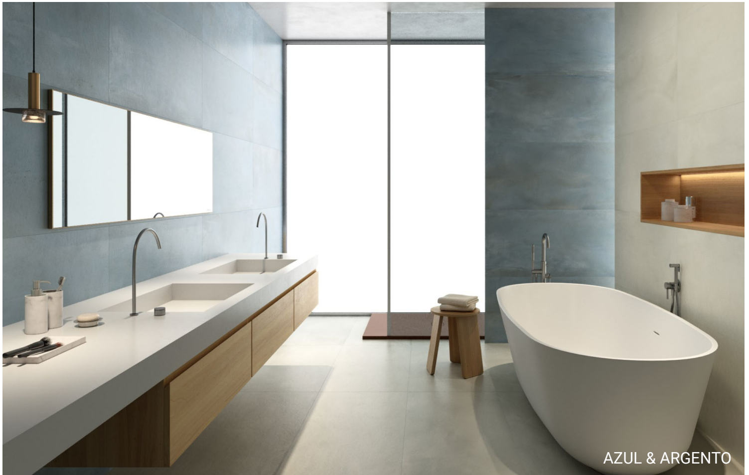
AZUL & ARGENTO