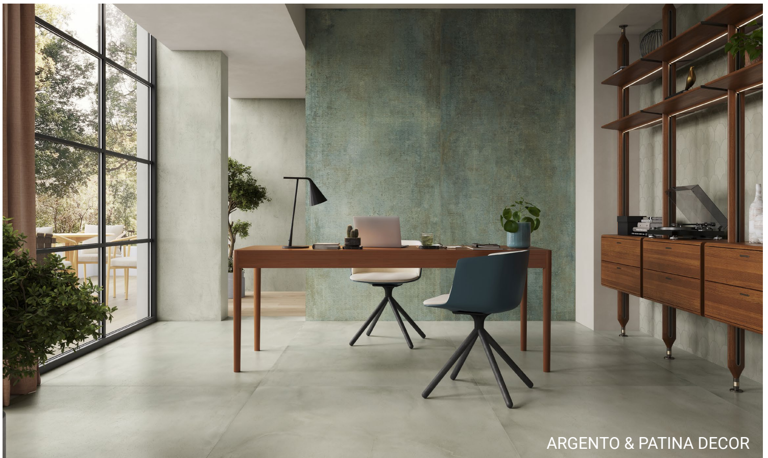
ARGENTO & PATINA DECOR