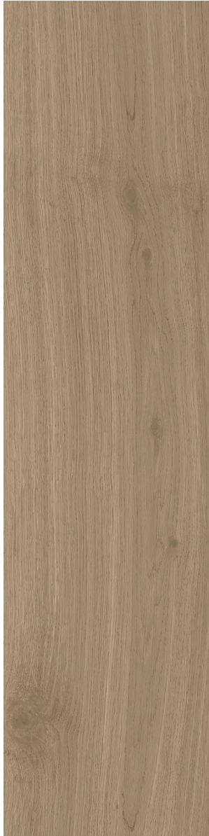
CAMEL (Beige) 22.5 x 90 cm (9" x 36") Matte Finish Nominal Thickness 8 mm WA.WD.SGR.0936.MT