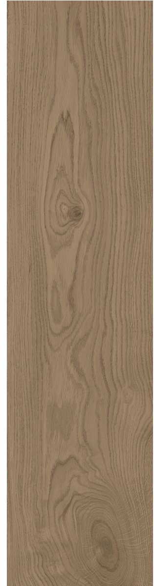
TAMARIND (Brown) 22.5 x 90 cm (9" x 36") Matte Finish Nominal Thickness 8 mm WA.WD.TMD.0936.MT

All items shown in this document are part of Olympia's stocking program. For special orders, please contact your Olympia Tile Sales Representative.