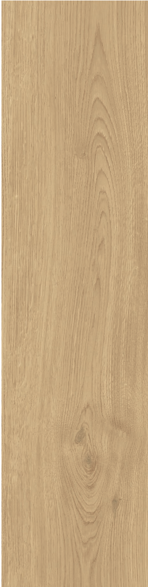
SUGAR (Light Beige) 22.5 x 90 cm (9" x 36") Matte Finish Nominal Thickness 8 mm WA.WD.CML.0936.MT