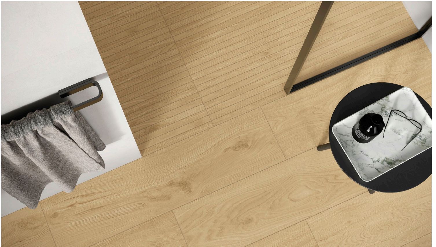
SUGAR (Light Brown)