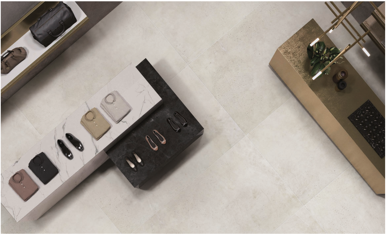
LIGHT GREY Matte