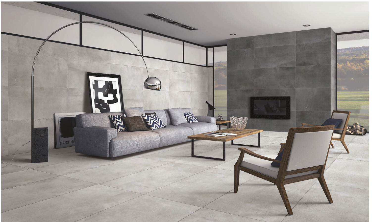
MEDIUM GREY Matte